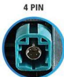
BMW CIC MENU