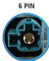
BMW NBT/EVO MENU

Usually, cars with CIC-menu should have 4 PIN LVDS, but in some special cars ( mostly BMW 1 series and BMW with 6,4 inch screen ) it is 6 PIN LVDS. In that case it's a NBT system.