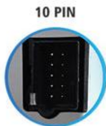
BMW CCC MENU